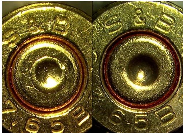
Fig 1 Comparison between two cartridge cases of the same brand, from different batches (carrying a different headstamp) fired through the same firearm.

A lot of weight was given to this argument in the BATF rebuttal, given the peremptoriness of the words used: "There is a glaring methodology flaw in the study design that colors the whole study, the data from that method, and necessarily the purported results of the data. (...) The results of correlations, the determination of drop-out of candidates in a growing database, the ability for this reference set of casings to find other brand matching casings - all of these results are skewed due to the selection of Federal Brand ammunition." [G, p.15]